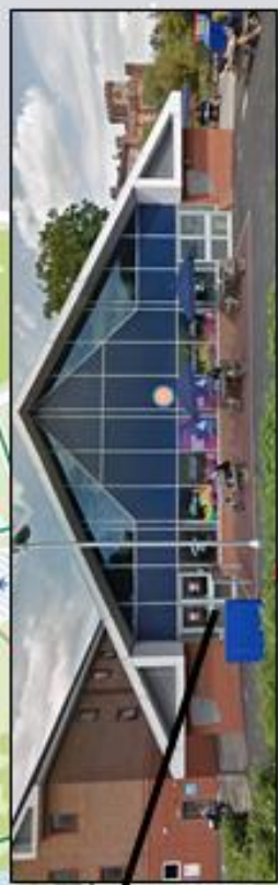
Eat at the Square Entrance