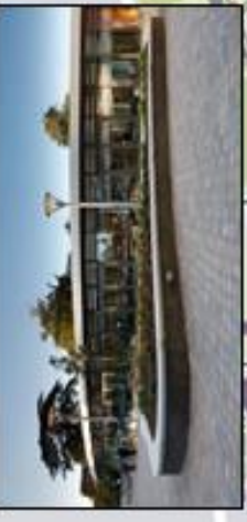
Park Eat/Park Bar