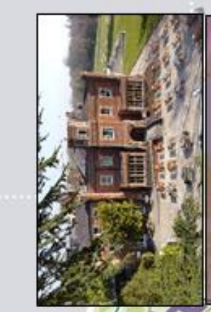
Park House Bar