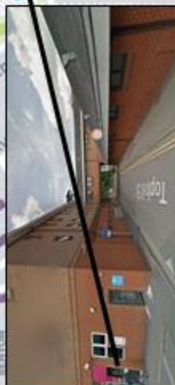
The Cedars Hotel