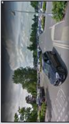
Car Park 1a